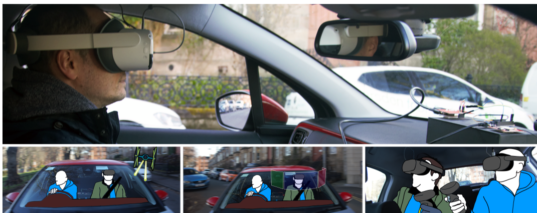
Figure 1: PassengXR lets practitioners create multi-passenger XR experiences based on the motion of any vehicle, supporting immersive gaming (bottom left), productivity (bottom middle) and collaboration (bottom right).

School of Computing Science, University of Glasgow Glasgow, UK