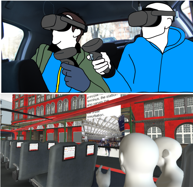
Figure 6: Image of the Shared Location-Based Bus Tour application, where two networked users share the same experience in a mock city bus tour, sitting inside a reference frame bus and viewing Augmented Reality-style information overlaid on a historic building as the bus moves along the street.

Unity Transform updates of each XR Rig to the other user. During the demonstration, the two users are sat next to each other in the ReferenceFrame virtual tour bus whose movement along the street is updated using the FusedWorldPosition provider based on the previously outlined LBE approach. As the bus passes the building, location-based triggers cause AR-like overlays to appear, and the users can e.g., point to parts of the scenery to draw their partner’s attention to it. The city model was supplied by Glasgow City Council and we used a bus asset from the Unity store [11].