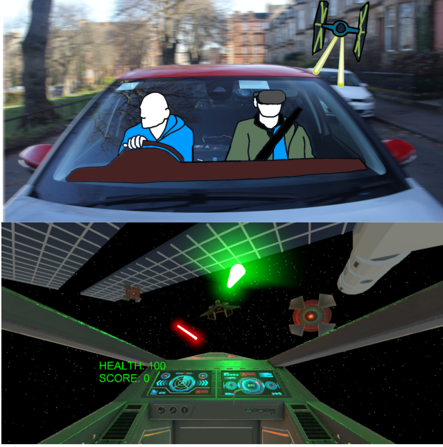
Figure 4: Illustration showcasing the Matched Virtual and Physical Movement application (top), where the movement of the virtual spaceship (bottom) reference frame matches the movement of the real car the passenger is inside.

with the trigger button. We used assets from the Unity asset store to create the experience [1, 8–10, 20, 46].