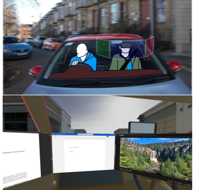
Figure 5: The Movement-Locked Content for Productivity application, where a single user interacts with web-based word processor, pdf and video content locked to the reference frame of the virtual vehicle they are sat inside. A digitised city route updates around the vehicle based on the real location.

A passenger is commuting to their office in their autonomous vehicle and wants to do work on the way. There are two facets of PassengXR demonstrated in this application. Firstly, we lock productivity applications to the reference frame, so that they always remain in front of the passenger (Figure 4). Secondly, we display the movement of the real car through the city, by rendering a digital recreation of the streets via Mapbox 16 . This peripheral motion may help reduce motion sickness [4, 5, 34] and help the passenger’s awareness of the journey progress. A digital car is rendered around the user and set as the reference frame (ReferenceFrame). Three 3DWebView 17 CanvasWebViewPrefab objects are children of the car, placed in a horizontal arc at head height inside the car cabin (showing a pdf, a Word document, and a YouTube video, see Figure 5). For the city, a Mapbox CitySimulatorMap prefab renders a set of tiles that contain real street and building data based on a latitude and longitude pair, centred on a position in Unity world space. A script GPSUpdater is added to the prefab, which takes the VehicleProtobufSensor as a variable, and uses the GNSS data from vehicle telemetry to update the latitude and longitude of the rendered tiles. The MotionPlatform sets the WorldRotation of